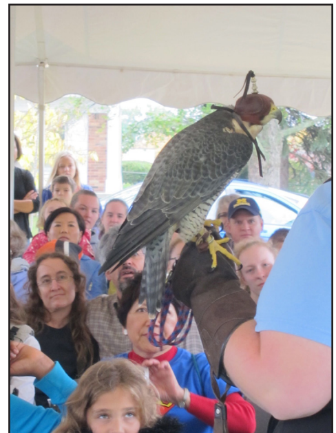
The Perigrine Falcon was a hit at the 2012 Fall Festival.