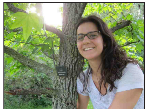
Enjoying the Trees

3. Trees -- Did you know Thurston Nature center is home to 68 species of Michigan trees? Many of these now have new labels! Read about this and the Tree Pals Program and Adopt-a-Tree program at the Thurston Nature Center website, Trees link.