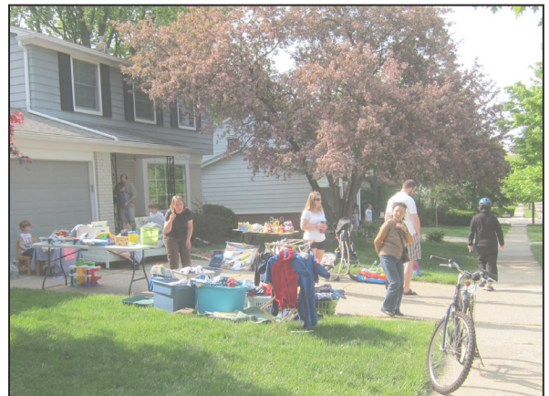
The Annual Garage Sale is a fun tradition.