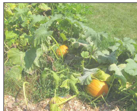
Pumpkins in the Thurston School Vegetable Garden

6. Thurston School Vegetable Garden: To support and enhance the Thurston Elementary curriculum with outdoor educational experiences like our Thurston Nature Center – (stressing knowledge, characteristics, interrelationships and uses of our natural resources) - members of the TNCC, parents and teachers from Thurston School, and community volunteers decided to build a vegetable garden. The garden is located on the south side of the Thurston Nature Center and close to the school. The students will be able to experience aspects of an agricultural environment and connect nature with nutrition. It is the hope that this will enrich the students' understanding of the relationships between what they eat, personal health, community interactions, and our environment. We also hope this will be fostering a deeper connection that the way our food is produced can help empower students to make healthier nutritional choices for life. ■