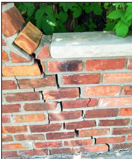
Wall in need of maintenance

Several repair options are under consideration, including a phased restoration approach (address the most critical needs as funding allows), a complete and comprehensive restoration of the existing structures, or complete removal of the structures as they exist followed by rebuilding the entrance walls, possibly to a lower height, reusing the existing brick.