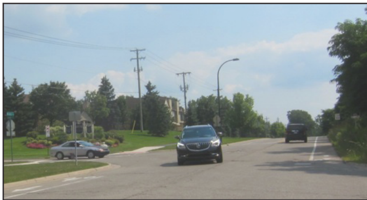
Nixon Road, facing south towards the jagged intersection with Dhu Varren and Green Rd.

Through the extraordinary efforts of our teachers, parents, and community members, "Safe Routes to Schools Grants" were issued to both Thurston Elementary and Clague schools with the intent of providing infrastructure additions and changes to make safer passages (walking and bicycling) for the students. Crosswalks and signage have been added on Green Road as a result of the Thurston grant. New sidewalks and some additional signage and crosswalks on Nixon are planned using the Clague grant and are scheduled for later this year. Additional safety measures, such as streetlights on Nixon in the vicinity of Clague, are currently not in city