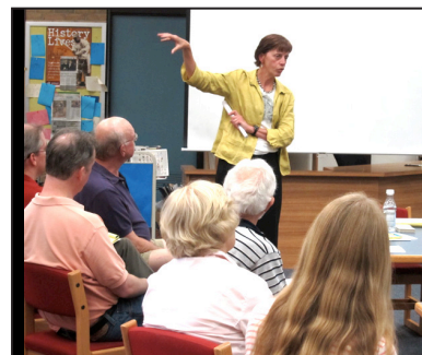
Neighbors listen to presentation about the North Campus Research Complex.