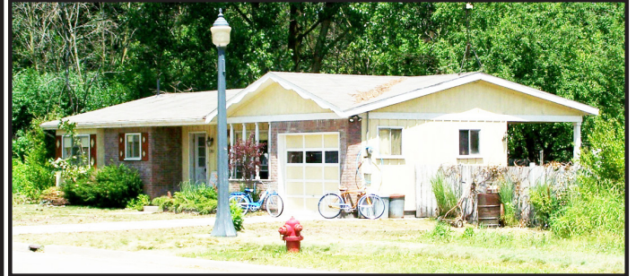
House built for filming "Flipped"

Construction of a set (house) on the edge of the Thurston Prairie began on June 10. Actual filming by Castle Rock Pictures began July 13 and