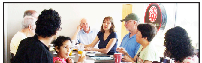
The Fall Festival Planning Committee met at Sweetwaters on August 15.

This Fall Festival is sponsored by OHMHA together with the Thurston Nature Center. We look forward to seeing you! ■