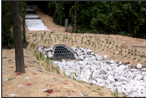
Stairs from Bluett, outlet of “big pipe,” and forebay, north of Thurston Pond.

Recent work supported by the Michigan Department of Environmental Quality Grant to the Ann Arbor Public School District included installing two large Aqua-Swirl units (underground) to clean stormwater and installing the more spectacular, big pipe deep beneath the concrete steps down the right-of-way from Bluett. This pipe will divert substantial additional supplies of stormwater