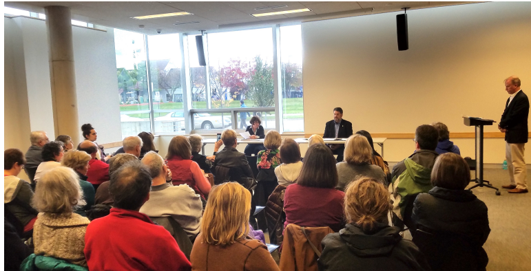
An OHMHA-sponsored candidates forum in 2017