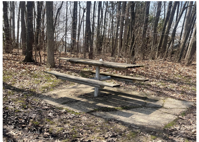
Time to rennovate this Sugarbush Park picnic table.

OHMHA is also working on facilitating the renovation of the picnic table in poor condition at Sugarbush Park, and a donation to add a short segment sidewalk access for strollers and wheelchairs. The picnic table (see photos) is by the smaller playscape, commonly used by younger families in the neighborhood. ■