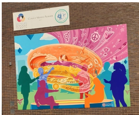
Mural at Clague Middle School

Many thanks to all the speakers and all the neighbors who tuned in and participated. ■