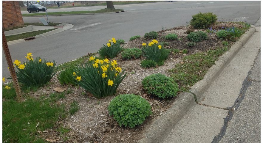
The garden at Georgetown and Plymouth creates an attractive entrance to our neighborhood.