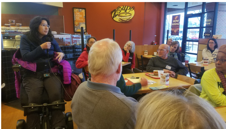
Community members shared thoughts on the proposed expansion of the medical marijuana dispensary at Nixon and Plymouth among other topics.

Many will feel we have had less success in affecting City government decisions that have consequences for our neighborhoods. The Forum emphasized that we need to increase our interaction with City officials at all levels with positive, fact-based and well-argued inputs to ensure that we are not left out of the decision-making processes that ultimately affect our area. ■