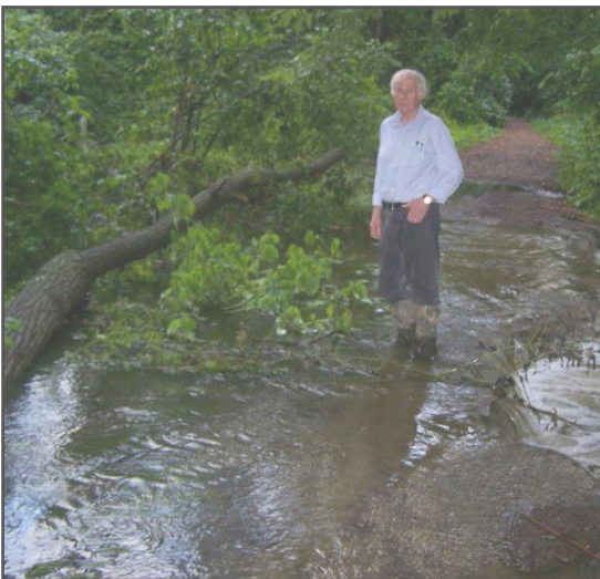
The berm falls apart 1 to 2 times per year and repair costs are adding up.