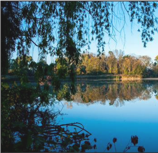
Pond full of water – unfortunately during the spring so much water is received that it spreads horizontally and kills many of the nesting areas.