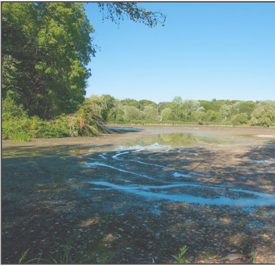
The TNC Pond - almost no water left during some summers.