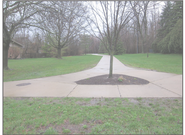
Under the Safe Routes to School program plan, this sidewalk at the north end of Georgetown will lead up to a crosswalk across Green Road.

A separate, September 2012 Safe Routes grant (for Clague Middle School) is tentatively scheduled for construction in late summer/fall of 2013. This work will involve constructing new sidewalks on the east side of Nixon Road and an additional pedestrian island on Green Road. For more information on the Safe Routes to School program, see http://saferoutesmichigan.org/sr2s ■