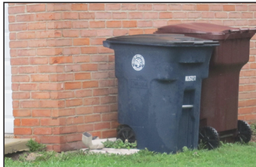
An appropriate place to store refuse containers is at the side or rear of the dwelling, according to guidelines on the City's website.