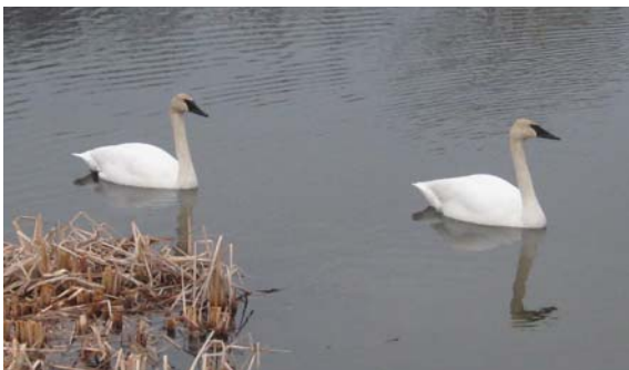
Trumpeter swans on Thurston Pond.