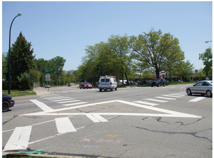
(Above) The current Nixon and Huron Parkway intersection.