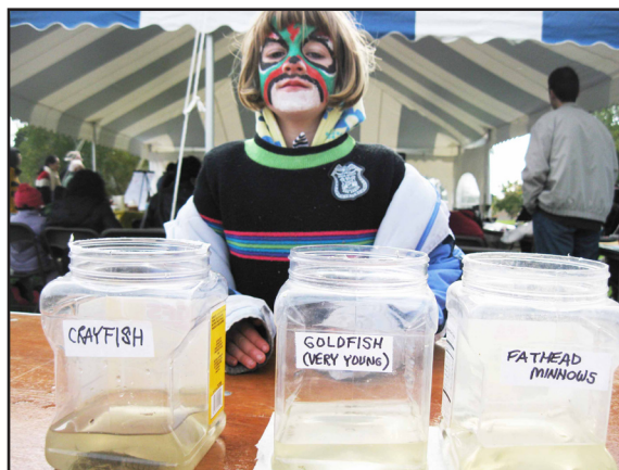
Chinese Facepainting and a display of live pond critters were among the many treats at the Fall Festival in October.

instruments to violin and keyboard. Chinese face painting and Firefly the Magic Clown were sponsored by Michigan Taiwanese American Organization and AAUW-Ann Arbor Branch.